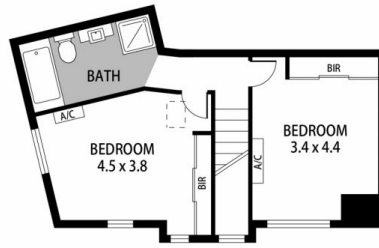
//FLOOR PLAN/First Floor