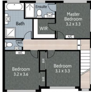
//FLOOR PLAN/First Floor